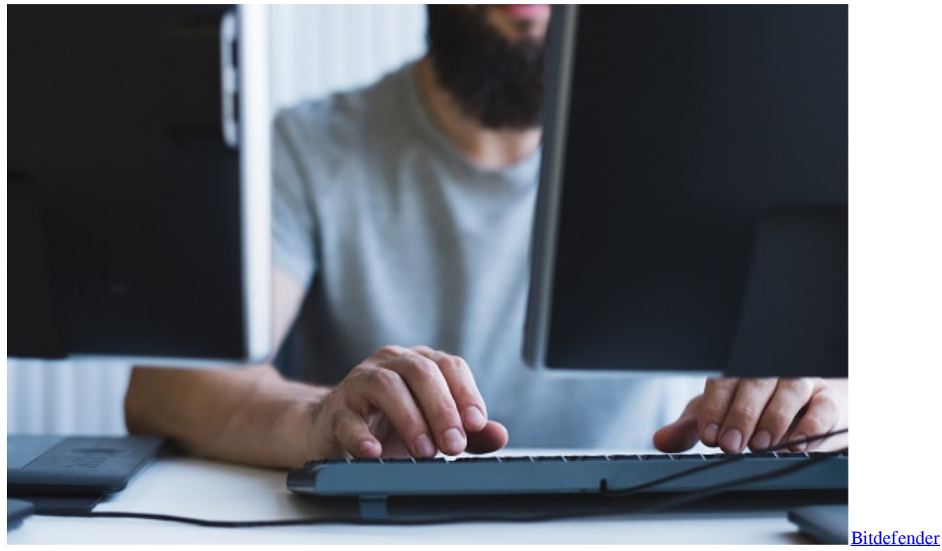
Total Security 2019 Crack With Serial Key Free Download

Jump to The Cons Of Owning Your Own Business - In my current situation, I have decided to work full time and run my businesses on the side because there are elements of both that make me happy. ... These days, whenever someone asks me whether they should quit their job and start their own business cold turkey, I often tell them not to quit.. UNTIL you actually RUN a business and not do the "job" you are still technically just working a job you created, not a owning a business. So I wouldn't say that ... Mailbird Pro 2019 Free Download